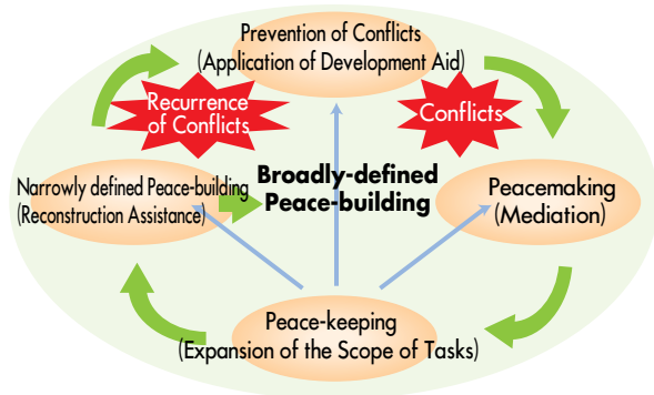
Figure 2 [developed by Yasunobu Sato]

post-conflict (or post-peace-keeping) reconstruction to the consolidation of peace. However, the main purpose of post-conflict peace-building activities is to prevent the recurrence of conflicts (conflict prevention). As such, once conflicts have flared up again, peace-building efforts can involve even the processes of mediating conflict, ending violence and maintaining a cease-fire. This is why the Canadian government has set forth a wider, inclusive concept of peace-building, encompassing the whole series of these activities. In addition, the “Guidelines on Conflict, Peace, and Development Cooperation,” issued by Development Assistance Committee (DAC) of the Organization for Economic Cooperation and Development (OECD) in 1997, confirms the significant roles that development aid plays at different stages of conflicts (before, in the middle of, and immediately after conflicts). It has also made specific suggestions for each stage, based on the concept that the principal purpose of development aid is to strengthen the rule of law and facilitate the participation of the general public in democratization processes. As exemplified by these two moves, “peace-building” is becoming an increasingly more inclusive concept, even covering the prevention of armed conflicts. In addition, an increasing emphasis is being placed on coordination with development aid activities (cf. Figure 2).